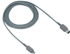
VMC-IL4615/IL4635 (4-pin to 6-pin, 1.5 m/3.5 m) i.LINK Cable