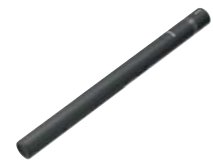
ECM-670/672/678 Electret Condenser Microphone (CAC-12 Camera Microphone Holder is required)